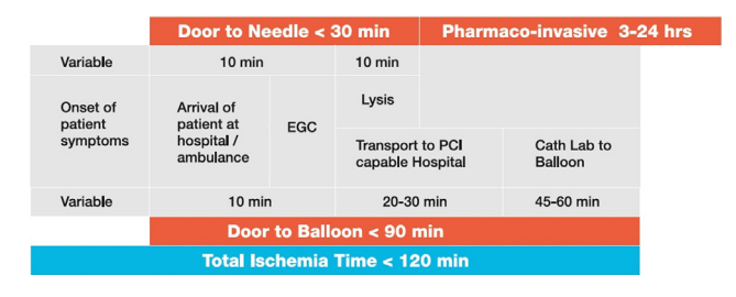
Fig. 1 – Recommended timelines for management of STEMI. FMC – First Medical Center, PHC-Primary HJealth Center.

Class B hospital is also a hub hospital, however, the catheterization laboratory does not function 24/7. Patients would have primary PCI during regular working hours but may